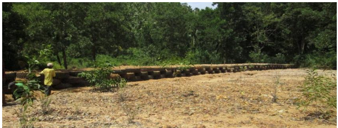
Used-Tires Silt Barrier Dike at MMC Suyoc-Kinto Limbo Waste Dump