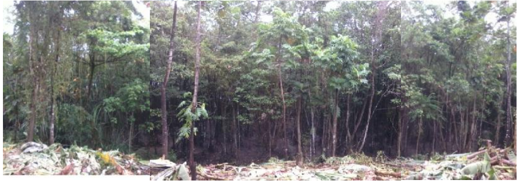
Bayatakan Giant Mangroves ( Sonneratiaalba )