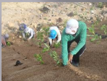
DENR 13 and MMC Workers

On November 28, 2011 the Company joined the DENR Secretary banner program of “Adopt- an-Estero/Creek/River Program” . Significant accomplishment during the year was desilting the MMC adopted Mapaso Creek of Barangay Magsaysay using manpower and heavy equipment. This had successfully mitigated the perennial problem of creek overflow and flooding large adjacent area and the national highway.