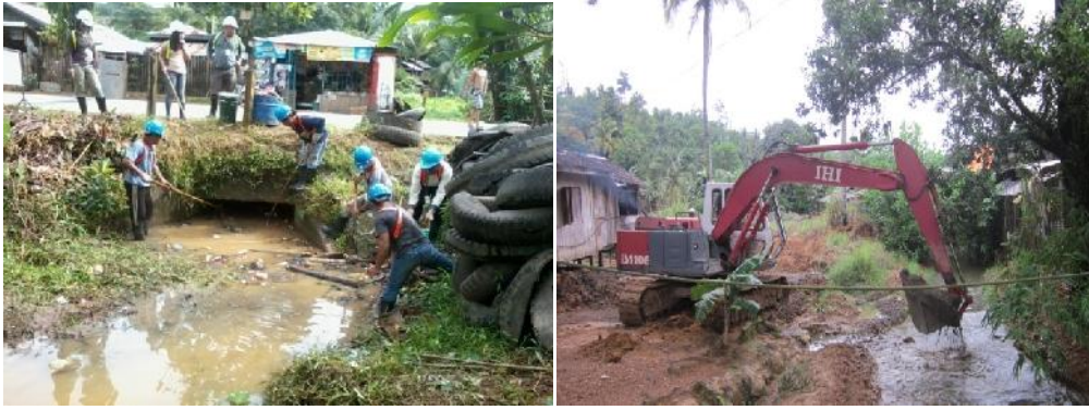
Manual and Heavy Equipment Desilting of Mapaso Creek