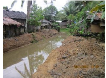
Joint MMC-DENR Slope Vegetation Research Project