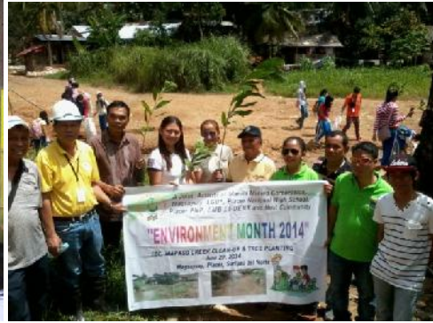
MMC on “Dengue Prevention” and Ecological Solid Waste Management IEC & Tree Planting