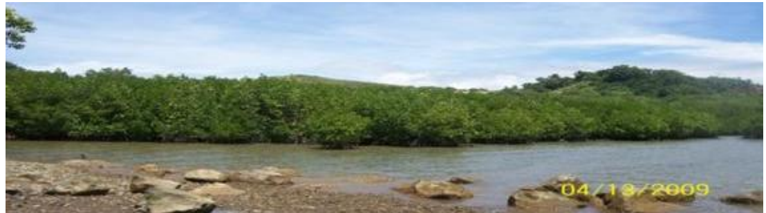
Bayatakan Medium Growth Mangroves ( Rhizophoraapiculata )