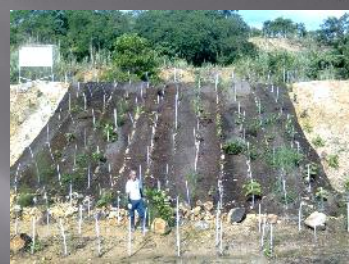
Engineering Measure Using Coco Mat